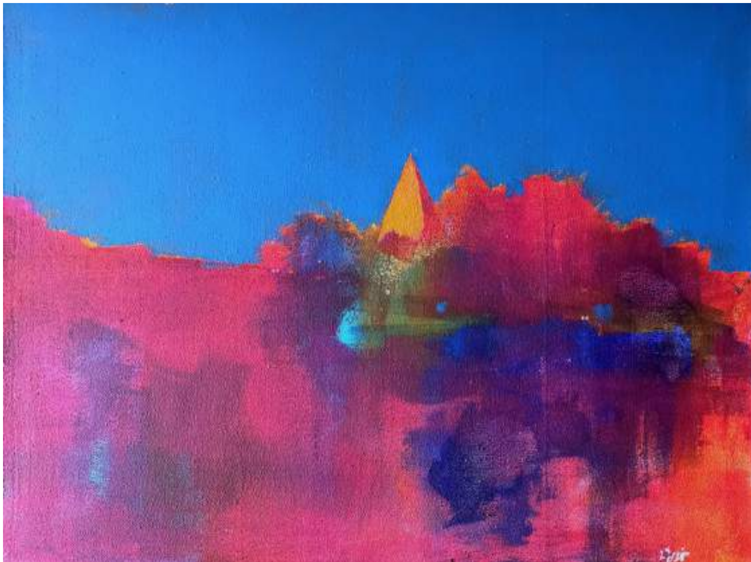
‘Yellow Shrine’ 2025