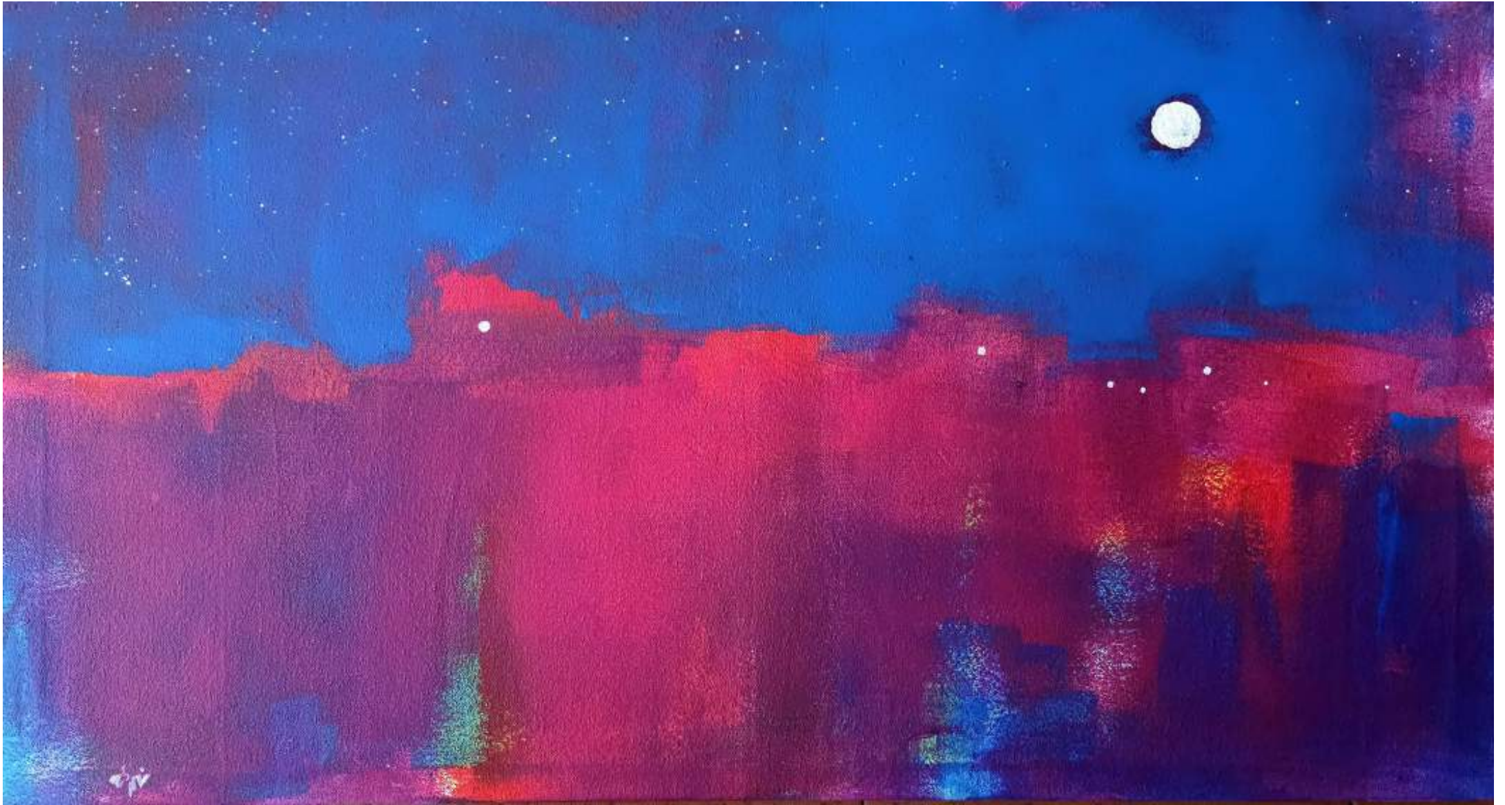
'Village and full moon' 2025 Acrylic on canvas 50x94cm